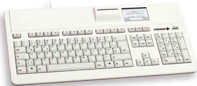
Figure 1: G87-1505

The TOE uses the USB- Interface of the HOST-PC for power supply.