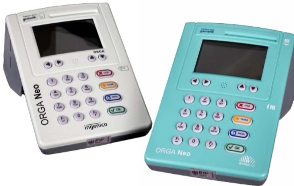
Figure 1 ORGA 6141 online

The ORGA 6141 online is a card terminal with graphical display: