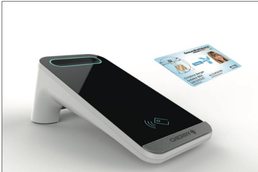
FIGURE 1.1: TOE

The Target of Evaluation (TOE) described in this Security Target is a smart card terminal which fulfils the requirements to be used with the German electronic Health Card (eHC) and the German Health Professional Card (HPC) based on the regulations of the German healthcare system. Please refer to see [gemSpec_KT] for further information about card compatibility. This terminal is based on the specification for a “Secure Interoperable ChipCard terminal” ([SICCT]) extended and limited by the specifications for the e-Health terminal itself (see [gemSpec_KT]).