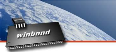
Table of Figures