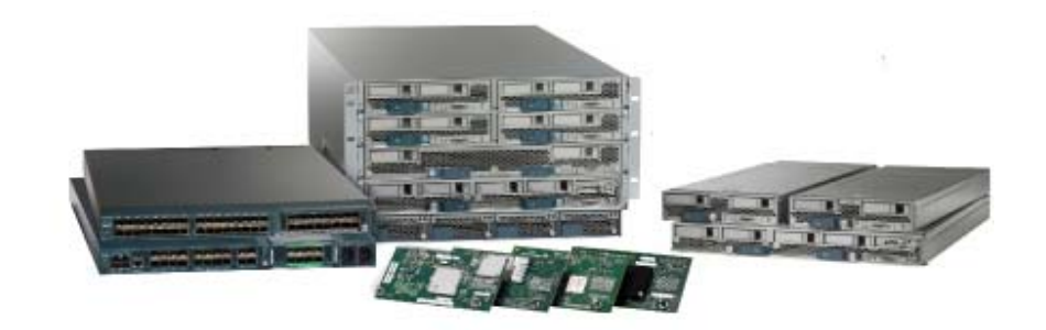
Figure 2: UCS Hardware

The underlying UCS platforms that comprise the TOE have common hardware characteristics. These differing characteristics affect only non-TSF relevant functionality (such as throughput, processing speed, number and type of network connections supported, number of concurrent connections supported, and amount of storage) and therefore support security equivalency of the ASAv in terms of hardware.