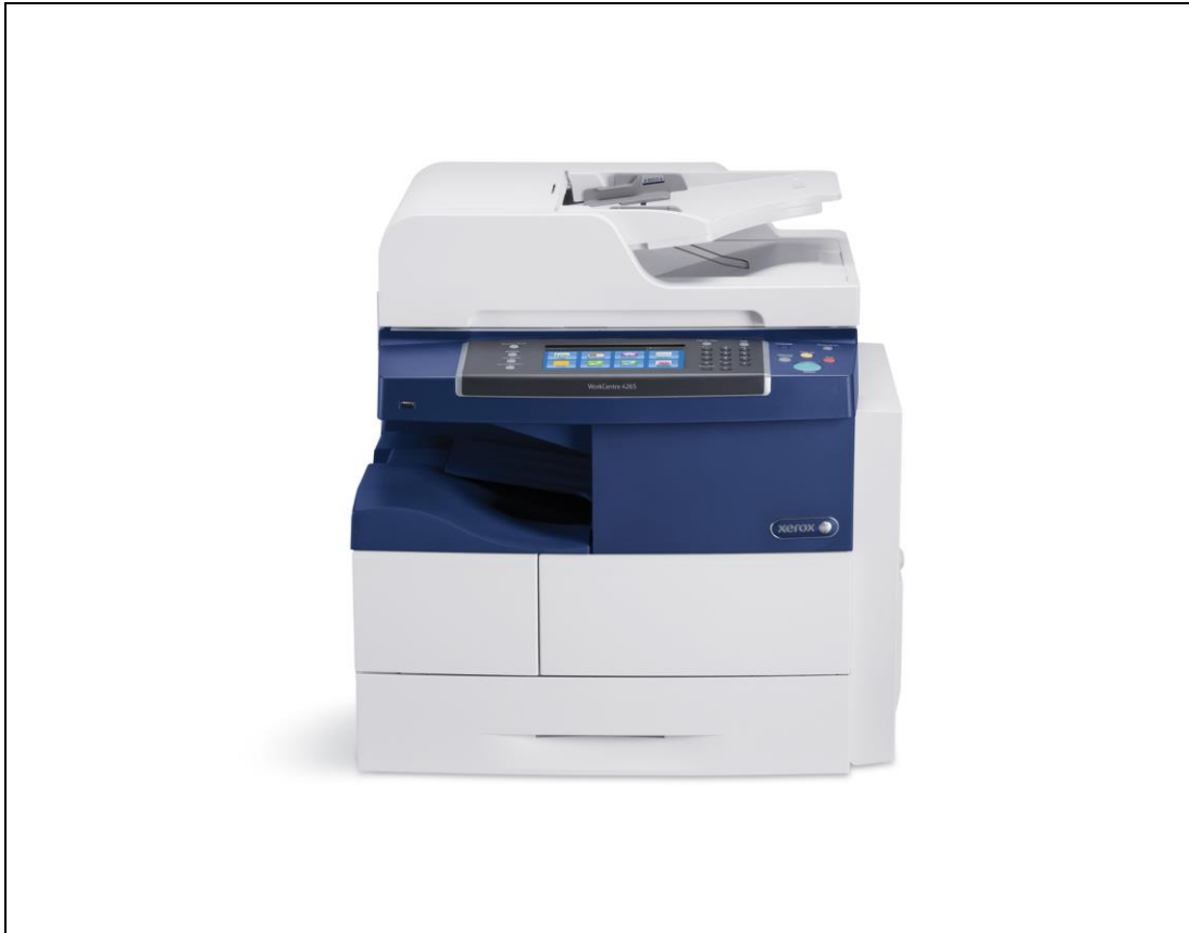
Figure 1: Xerox WorkCentre 4265

The TOE can integrate with an IPv4 network with native support for DHCP. The hardware included in the TOE is shown in the figure below.