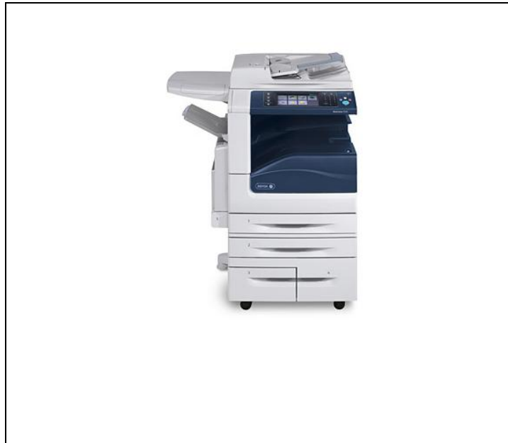
Figure 2: Xerox WorkCentre™ 7525/7530/7535/7545/7556

The hardware included in the TOE is shown in the figure below.