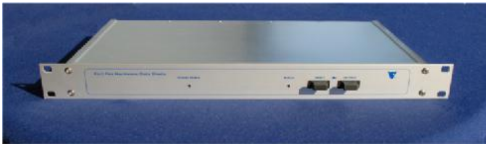
Figure 2 The TOE

The TOE has two operational interfaces to establish one-way communication, the Bidirectional Input and Unidirectional Output port. At the Low Security Level Transceiver light is carried into the Bidirectional Input port and converted, with the aid of a photocell, into an electrical signal. The electrical signal spreads through the TOE to the High Security Level Transceiver. The High Security Level Transceiver receives the electrical signal and converts this, using a light source, into light. Finally, the light is offered, through the Unidirectional Output port, to the High Security Level Network.