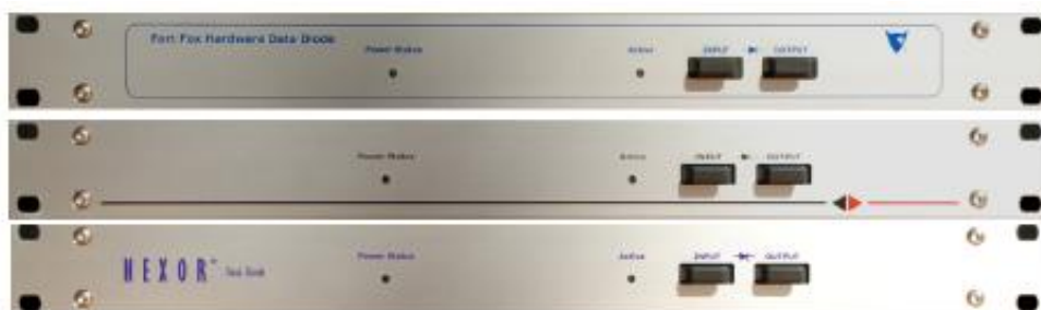
Figure 3 Three variants for the front panels of the TOE