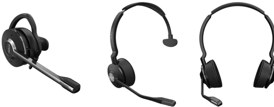
Figure 2 Convertible (left), Mono (middle) and Stereo (right) Headset

The Headset form factors are identical for models compatible with Jabra Engage 65 and Jabra Engage 75 but the software differs to handle the differences in the Base Station interfaces. There are three TOE Headset form factor variants: Convertible, Mono and Stereo. The variants differ in a way they are worn by the user. They are illustrated in Figure 3. Functionally each headset variant is identical and runs identical software. The difference is in form factor only.