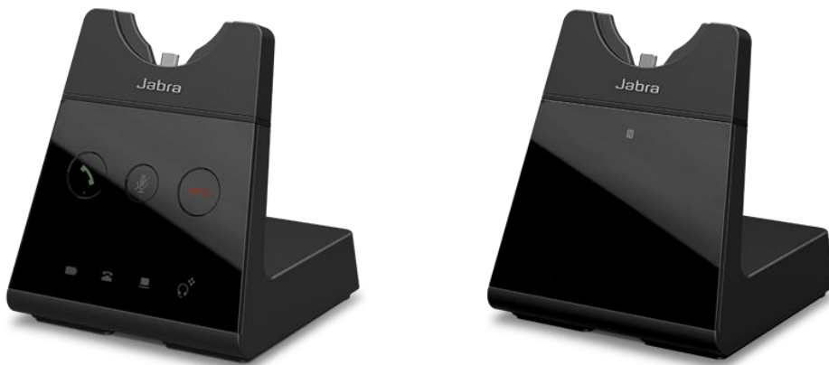
Figure 3 Jabra Engage 65 (left) and Jabra Engage 75 (right) Base Stations

The Headset form factors are identical for models compatible with Jabra Engage 65 and Jabra Engage 75 but the software differs to handle the differences in the Base Station interfaces. There are three TOE Headset form factor variants: Convertible, Mono and Stereo. The variants differ in a way they are worn by the user. They are illustrated in Figure 3. Functionally each headset variant is identical and runs identical software. The difference is in form factor only.