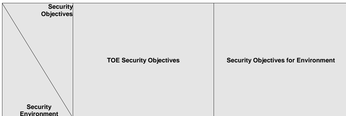
(Table 20) Mapping between Security Environments and Security Objectives

(Table 20) shows the mapping between security environments and security objectives.