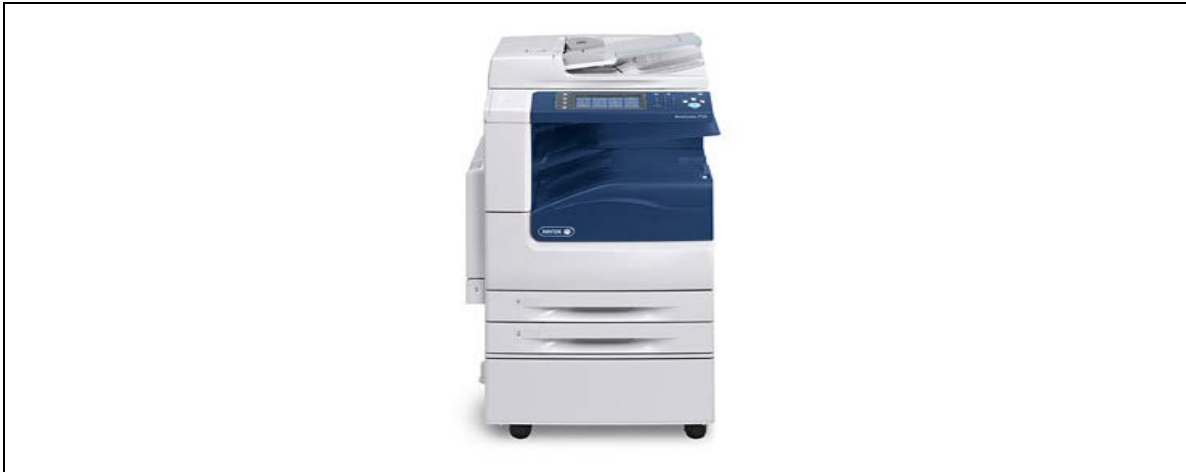
Figure 1: WorkCentre® 7220/7225 Xerox® ConnectKey® Technology with SIPRNet Support

The TOE can integrate with an IPv4 network with native support for DHCP. The hardware included in the TOE is shown in the figure below.