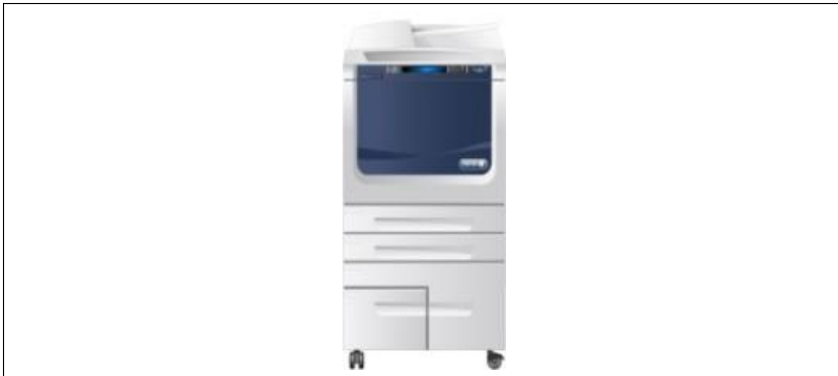
Figure 1: Xerox® WorkCentre® 5845/5855/5865/5865i/5875/5875i/5890/5890i 2016 Xerox® ConnectKey® Technology

The TOE can integrate with an IPv4 network with native support for DHCP. The hardware included in the TOE is shown in the figure below.