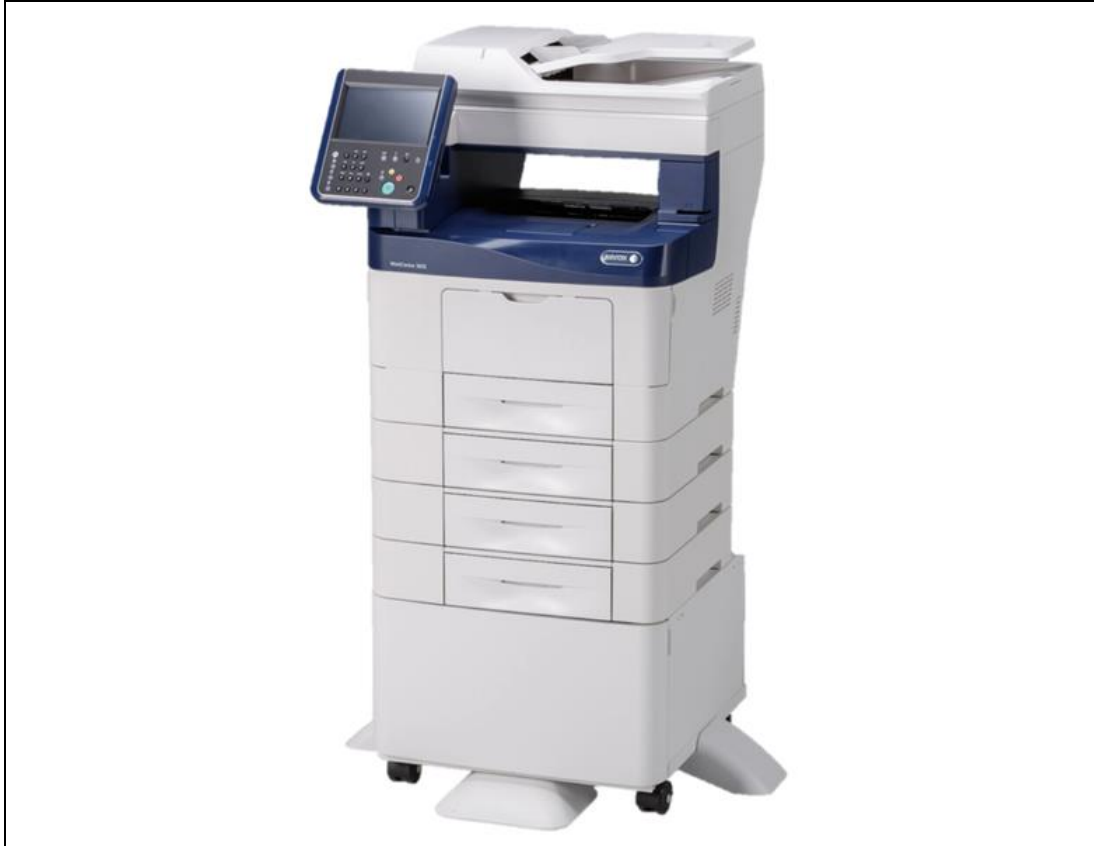
Figure 1: Xerox® WorkCentre® 6655/6655i 2016 Xerox® ConnectKey® Technology

The TOE can integrate with an IPv4 network with native support for DHCP. The hardware included in the TOE is shown in the figure below.