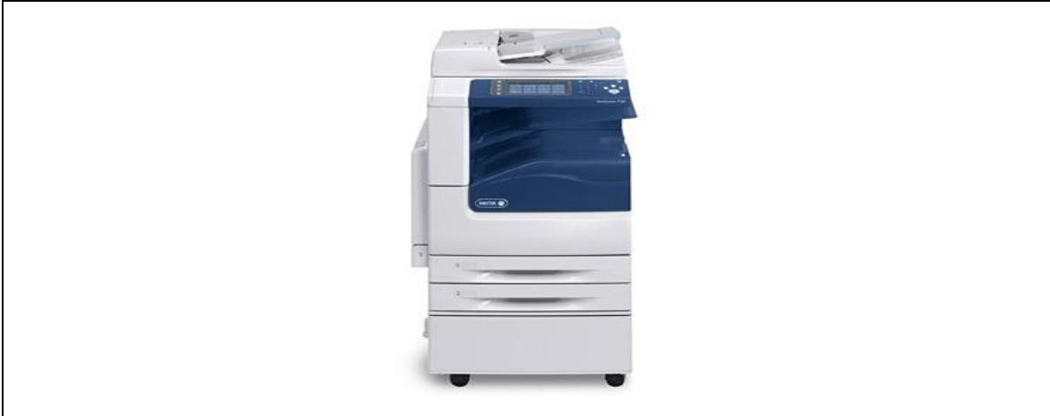
Figure 1: Xerox® WorkCentre® 7220/7220i/7225/7225i 2016 Xerox® ConnectKey® Technology

The TOE can integrate with an IPv4 network with native support for DHCP. The hardware included in the TOE is shown in the figure below.