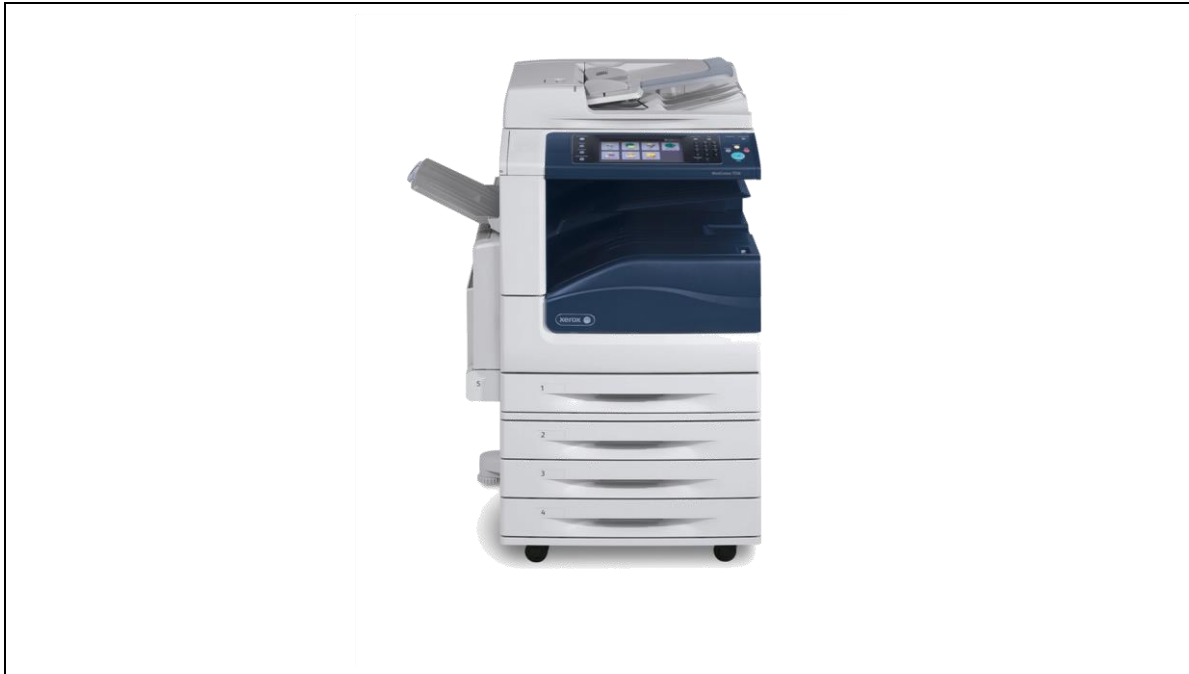
Figure 1: Xerox® WorkCentre® 7830/7830i/7835/7835i 2016 Xerox® ConnectKey® Technology

The TOE can integrate with an IPv4 network with native support for DHCP. The hardware included in the TOE is shown in the figure below.