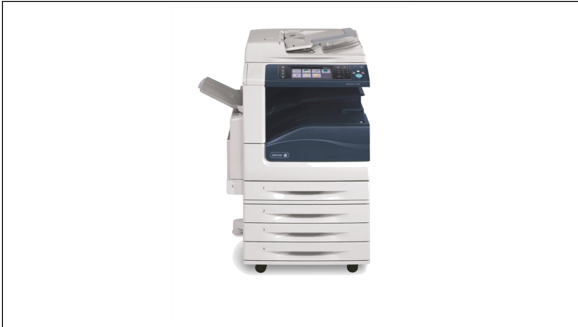
Figure 1: Xerox® WorkCentre® 7830/7830i/7835/7835i 2016 Xerox® ConnectKey® Technology

The TOE can integrate with an IPv4 network with native support for DHCP. The hardware included in the TOE is shown in the figure below.