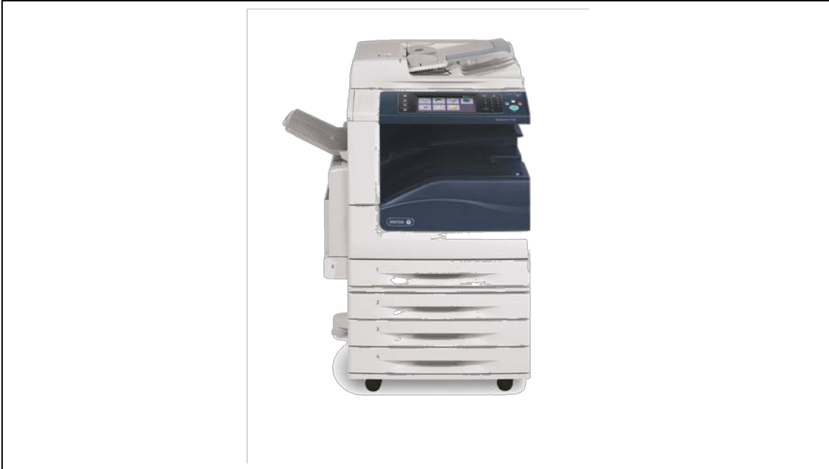
Figure 1: Xerox® WorkCentre® 7845/7845i/7855/7855i/EC7856 2016 Xerox® ConnectKey® Technology

The TOE can integrate with an IPv4 network with native support for DHCP. The hardware included in the TOE is shown in the figure below.