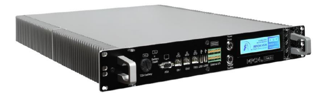
Figure 1 - Physical appearance of an MPCA

Depending on its configuration, the TOE consists of one or three MPCAs (Multi-Party Cryptographic Appliances). An MPCA comes in the form of a metal, rack mountable box (see Figure 1).