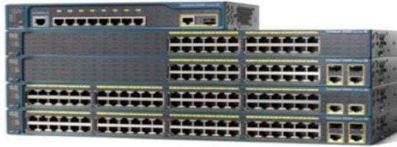
Table 3: Configurations of Cisco Catalyst 2960-S Series Switches