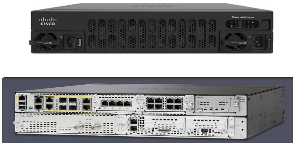
Figure 3 Cisco 4431 ISR