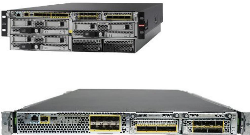
Figure 1: FP 9300 (first) and FP 4100 (second)

The hardware components in the TOE have the following distinct characteristics: