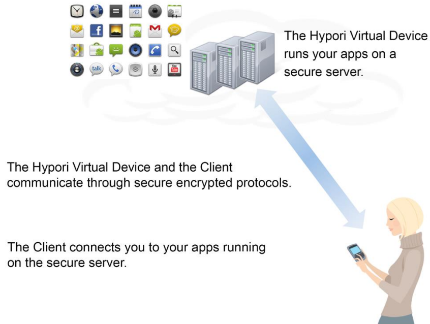
Figure 2 Hypori Client as Part of VMI Platform