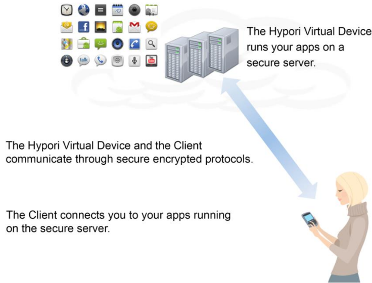
Figure 1 Hypori Halo Client Communication with a Hypori Virtual Device on a Hypori Server

The TOE comprises the Hypori Halo Client (iOS) 4.3 application that installs on the end user’s mobile device and communicates with the Hypori Virtual Device on the server using TLS 1.2 (provided by the underlying iOS platform). The Hypori Server, Hypori Virtual Device, User Management Console, Admin Console, applications running on the Hypori Server, the hardware platform device, and any functions not specified in the ST are outside the scope of the TOE. Figure 2 shows the relationship of the TOE to its operational environment.