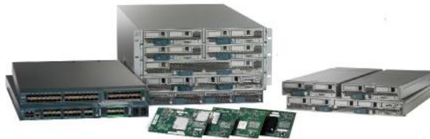
Figure 2: UCS Hardware

The UCS hardware components, which provide the platform for the FMCv, in the TOE have the following distinct characteristics: