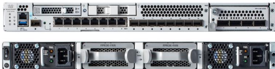
Figure 1: Cisco Secure Firewall 3100 Series Hardware (3105, 3110, 3120, 3130 and 3140)

The Cisco Secure Firewall 3100 appliances have the following distinct characteristics: