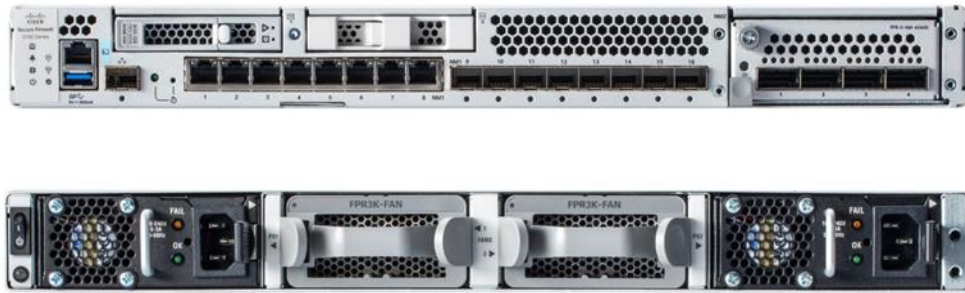
Figure 1: Cisco Secure Firewall 3100 Series Hardware (3105, 3110, 3120, 3130 and 3140)

The Cisco Secure Firewall 3100 models have the following distinct characteristics: