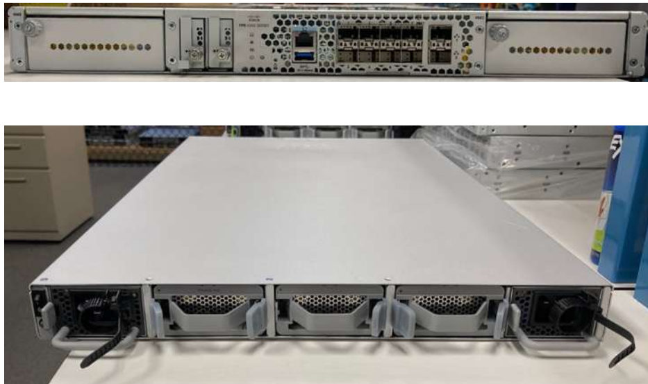
Figure 1: Cisco Secure Firewall 4200 Series Hardware (4215, 4225 and 4245)

The Cisco Secure Firewall 4200 models have the following distinct characteristics: