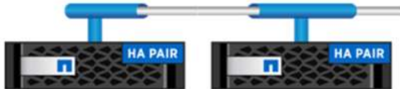
Figure 1 Basic TOE Configuration

NetApp appliances typically are configured in cluster nodes in high-availability (HA) pairs for fault tolerance and non-disruptive operations. The Nodes communicate with each other over a private, dedicated cluster interconnect. The HA interconnect allows each node to continually check whether its partner is functioning and to mirror log data for the other's nonvolatile memory. If a node fails or if a node needs to be brought down for routine maintenance, its partner can take over its storage and continue to serve data from it. The partner gives back storage when the node is brought back on-line. The HA functionality was not covered in the scope of the evaluation or testing.