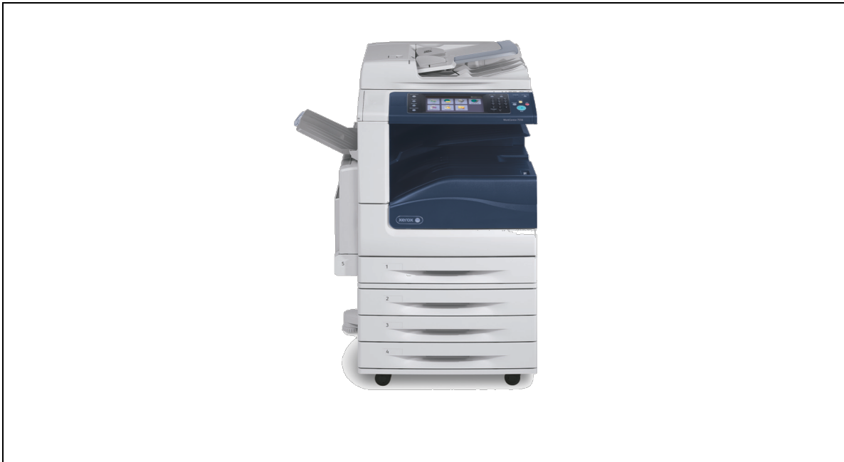
Figure 1: WorkCentre® 7970 Xerox® ConnectKey® Technology with SIPRNet Support

The TOE can integrate with an IPv4 network with native support for DHCP. The hardware included in the TOE is shown in the figure below.